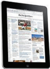
WIN an iPad or iPod Touch

QMS families who re-register their child and pay the tuition deposit for the 2011-2012 academic year by March 4th, 2011 will have their children's names entered to win an iPad or iPod Touch .